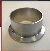
SHORT STUB END