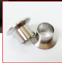
LAP JOINT STUB END