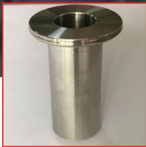
LONG STUB END