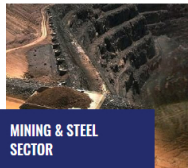
MINING & STEEL SECTOR