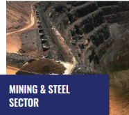
MINING & STEEL SECTOR